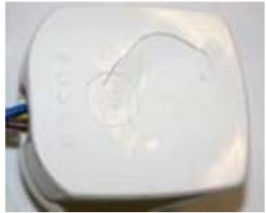
3a Damage to mains plug