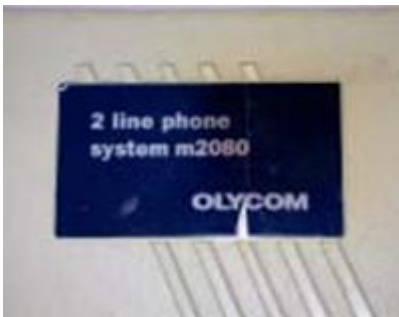
2c Evidence of overheating