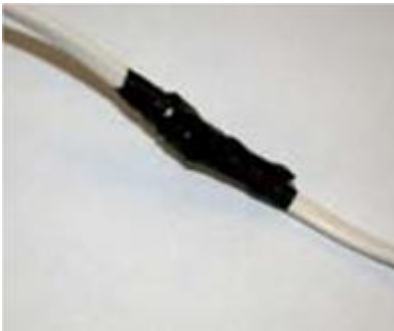
1b Taped joint of cable