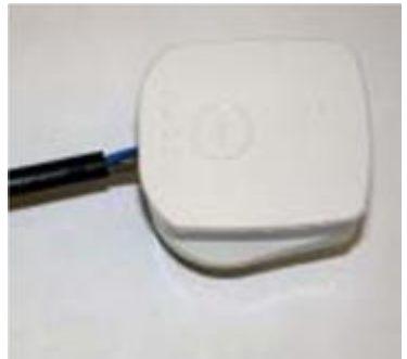
3b Inadequate strain relief