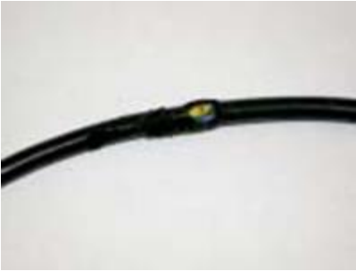
1a Damage to power cable sheath